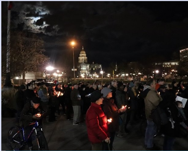
Hundreds gathered for the 29th annual Homeless Persons' Memorial Vigil, hosted by the Colorado Coalition for the Homeless on Dec. 22, 2018.