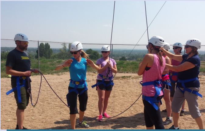
Participants in the BSET training prepare for a high-ropes team-building course.