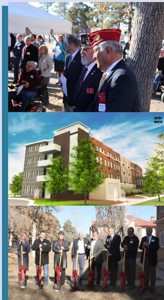
Top: Veteran onlookers attend the groundbreaking ceremony.

Construction will begin in 2019, and the goal is to have the apartment complex ready for its new residents by 2020.