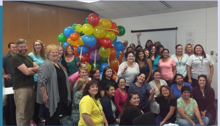
BSET participants pose for a photo after completing a team challenge.

Currently, the Colorado Center for Nursing Excellence (CCNE) and CCHN are currently recruiting participants for Cohort four of BSET. The program has been modified to decrease the out-of-clinic time for providers. A new companion program has been created to address this concern: BSET Leadership Development Program (LDP). LDP will include similar BSET content topics via class and web-based sessions that will have a reduced out-of-clinic time. LDP is not replacing the standard BSET training, but rather is designed to be an option for CHCs that may not otherwise be able to participate. LDP participants can choose to participate in the LDP only, or participants can attend LDP as a dedicated provider who will support a BSET team. The standard BSET program will continue to run similarly to previous cohorts. For more information, please click here .