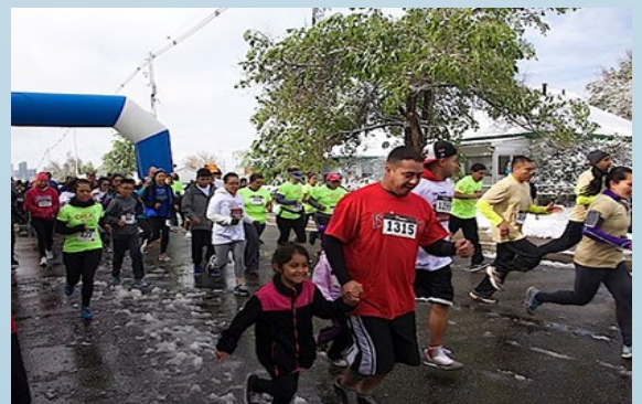
Participants of Clínica Tepeyac's 2015 ¡Adelante! 5K Run/Walk begin the race.

Join Clínica Tepeyac for the annual ¡Adelante! 5K Run/Walk, Community Expo, and Kids 1/2 Mile Fun Run. Click here for more information and to sign up!