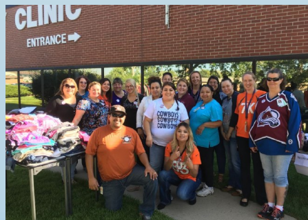
Sunrise's Monfort Family Clinic Garage Sale, 2017

The month before National Health Center Week, Sunrise Community Health starts collecting items for a big garage sale at their Monfort Family Clinic. The garage sale is first come, first serve, so get there early!