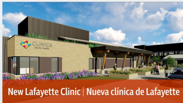
New Lafayette Clinic | Nueva clínica de Lafayette

Clinica Family Health is hosting a grand opening for its brand new Lafayette Medical & Dental Clinic. The new clinic is bigger, more comfortable, and offers a full-service dental clinic. Come by to celebrate the grand opening!