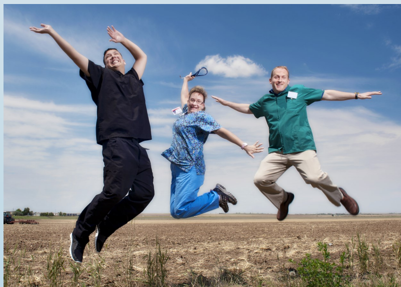
Health care heroes from Peak Vista Community Health Centers— Strasburg fly off to save the day!

Celebrating CHC Health Care Heroes takes more than a week, so Colorado CHC events are spread out over several weeks. Many local communities issue proclamations in support of their CHCs. Some CHCs host special clinic days for kids and teens to get up-to-date on their physicals and immunizations. And this year, some CHCs are taking their heroism to the next level and dressing up like super heroes for a day! If you want to join the action, keep reading for a list of events all over the state.