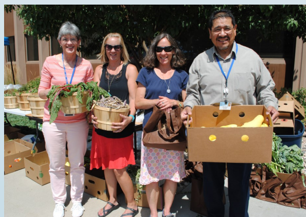
2017 Salud Farmers Market participants

Salud is partnering with Sproutin' Up to host their annual free Farmers Market for the community of Fort Collins in celebration of National Health Center Week. Come by either location for fresh produce and fun!