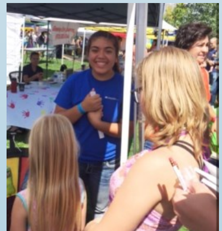
Staff and participants at Sunrise's 2017 Back-to-School Kickoff

Sunrise Community Health will be participating in an event to welcome families and kids back to school. As one of the corporate sponsors of the event, Sunrise will have a booth with kids' activities highlighting wellness and entertainment. They will also be giving away diapers for families who need them. And of course, they'll be celebrating the superheroes from Sunrise Community Health!