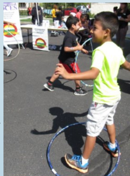
Kids playing with hoops at 2017 Sunrise Walk

After checking out the garage sale, you can head over to the Sunrise Walk, a community fair where local partners get to share what they do for the community. There will be activities for families and games for the kids, plus the chance to tour Sunrise's Monfort Family Clinic.