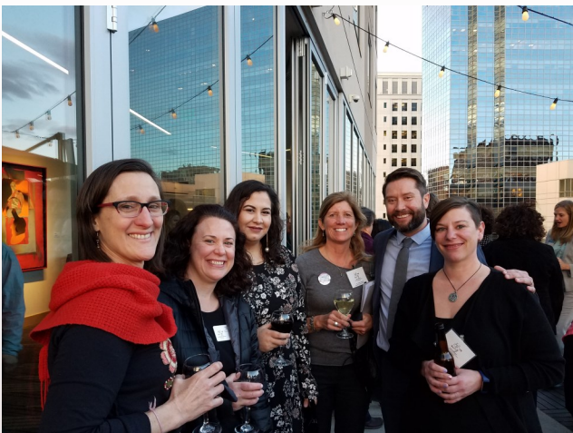
Above: P&I participants enjoy refreshments at the ART Hotel for the Legislator Reception and Awards Ceremony.