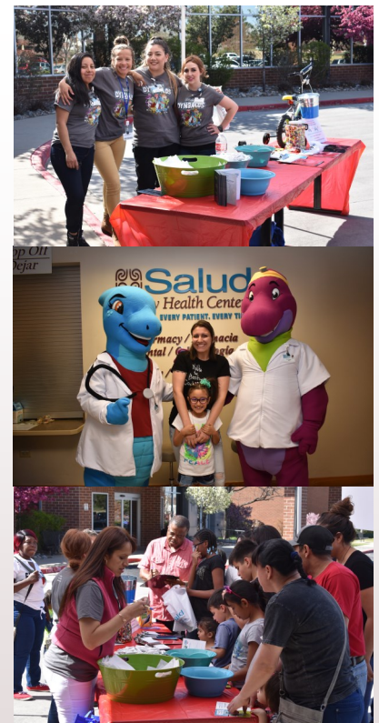
Above: Salud Family Health Centers hosts their mascot rollout event.

To learn more about Salud Family Health Centers, click here .