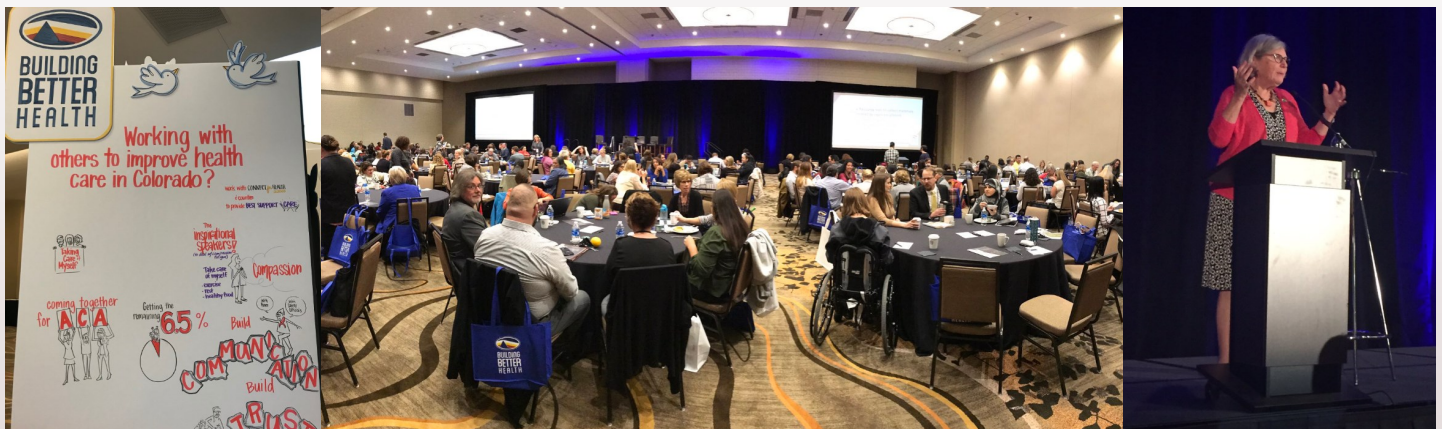
Left: A poster from the 2017 Building Better Health conference.

Visit CKF's website and follow CKF's Twitter for more updates and announcements. Building Better Health is funded by the Colorado Health Foundation and is planned in partnership with the Colorado Department of Health Care Policy and Financing, Connect for Health Colorado, the Colorado Consumer Health Initiative, the Colorado Division of Insurance, and PEAK Outreach.