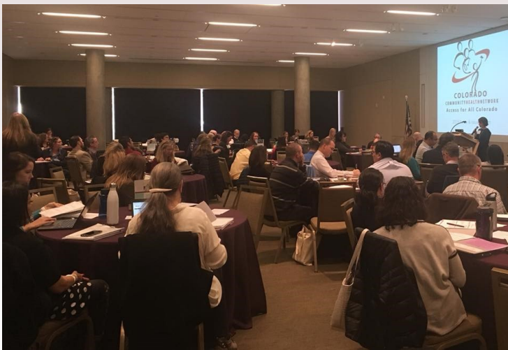
Above: Participants attend the CCHN 2018 P&I Forum.

At CCHN's 2018 Policy and Issues (P&I) Forum, Colorado CHC staff and board members learned about CCHN's top legislative priorities and spent a day at the state capitol speaking with elected officials. This year's P&I focused on the political environment over the past year, the implications of a potential loss of federal funding, and the impacts of an election year on health care policy in the state. More than 100 CHC advocates attended.