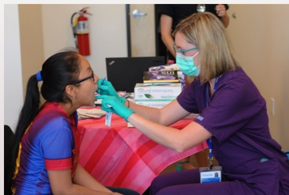
A young girl receives a dental screening at the opening .

The organization is especially grateful to the more than 30 wonderful employees and HealthCorps members who made the event a success!