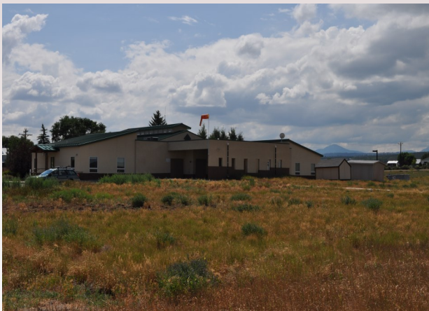
Uncompahgre Medical Center, Norwood, Colo.

Sheridan Health Services is one of the most active CHCs in terms of outreach. Sheridan's O&E team has held outreach events at the Mexican consulate, has established strong relationships with their local schools, and often participates at school resource nights and other school events. During open enrollment, one of the O&E staff spoke on a Spanish language radio station, which was a successful strategy to promote enrollment services at Sheridan.