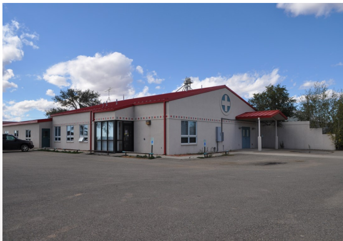
Dove Creek Community Health Clinic, Dove Creek, Colo.

Even though the O&E team at Dove Creek Community Health Clinic is small, people drive long distances just to seek enrollment help from Dove Creek's knowledgeable CACs. They have worked hard to build trust with their community members and help them and the clinic patients with a wide range of services. They often making house calls to help patients with paperwork or simply making sure that they have something to eat.