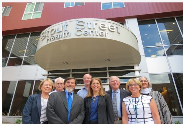
Coalition Staff and Sec. Burwell outside the Stout Street Clinic

The new Stout Street facility was made possible by the expansion of Medicaid eligibility in Colorado under the Affordable Care Act. Prior to the Affordable Care Act, only 15 percent of homeless individuals served by the Coalition were eligible for Medicaid. Today, nearly 70 percent of the Coalition's patients have been enrolled in Medicaid. The increased payments through Medicaid helped fund the new facility and expand the number of health care providers needed to care for the community. Secretary Burwell serves as vice chair of the United States Interagency Council on Homelessness, and she wrote about her recent visit and federal efforts to end homelessness on her blog .