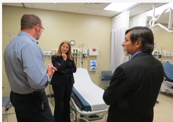
Sec. Burwell on a tour of the Stout Street Clinic