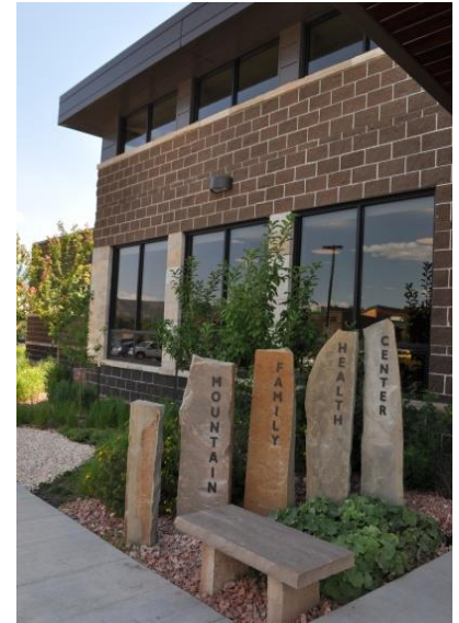
The new Mountain Family Health Center in Rifle.

Primary health care access expanded in Colorado with grand openings and ribbon cuttings of CHC facilities across the state. Mountain Family Health Centers (MFHC) opened a new facility in Rifle, with a ribbon cutting, speeches, expressions of thanks, a band, and barbecue. Across the state, High Plains Community Health Center (High Plains), which is celebrating its 16 th anniversary, hosted a grand opening celebration for the new Adult Health Center in Lamar. In Antonito, Valley-Wide Health Systems, Inc. (VWHS) celebrated the grand re-opening of the renovated and expanded Guadalupe Health Center. All three projects were partially funded by the American Recovery and Reinvestment Act. In addition, Metro Community Provider Network (MCPN) hosted the inaugural ribbon cutting celebrating MCPN's new Extended Care Clinic at North Aurora Family Health Services. The new facility will extend clinic hours in the evenings and weekends to accommodate increased access to primary care and other related services to the public and working families.