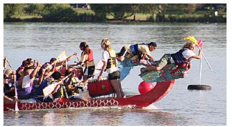
The Salud-Fort Lupton Dragon Boat team races for the finish line. July 25, 2010.