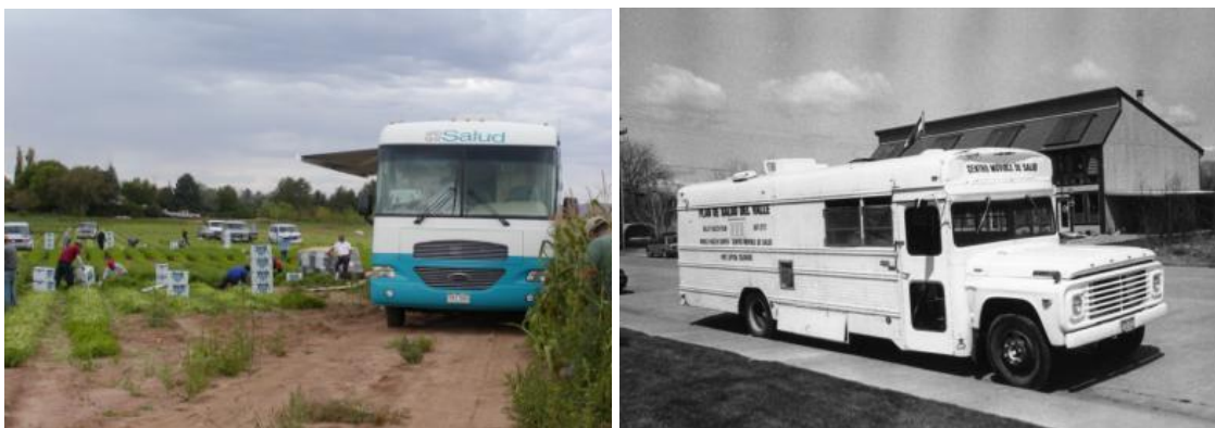
From left: Salud Mobile Health Center now, and then. On the last day of the conference, attendees boarded buses and visited Salud, touring the Commerce City Health Center, the Fort Lupton Administration and Training Center, and the Mobile Unit.