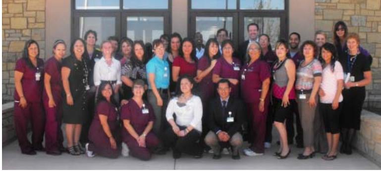
The staff of Salud-Fort Morgan gather in front of their new building.