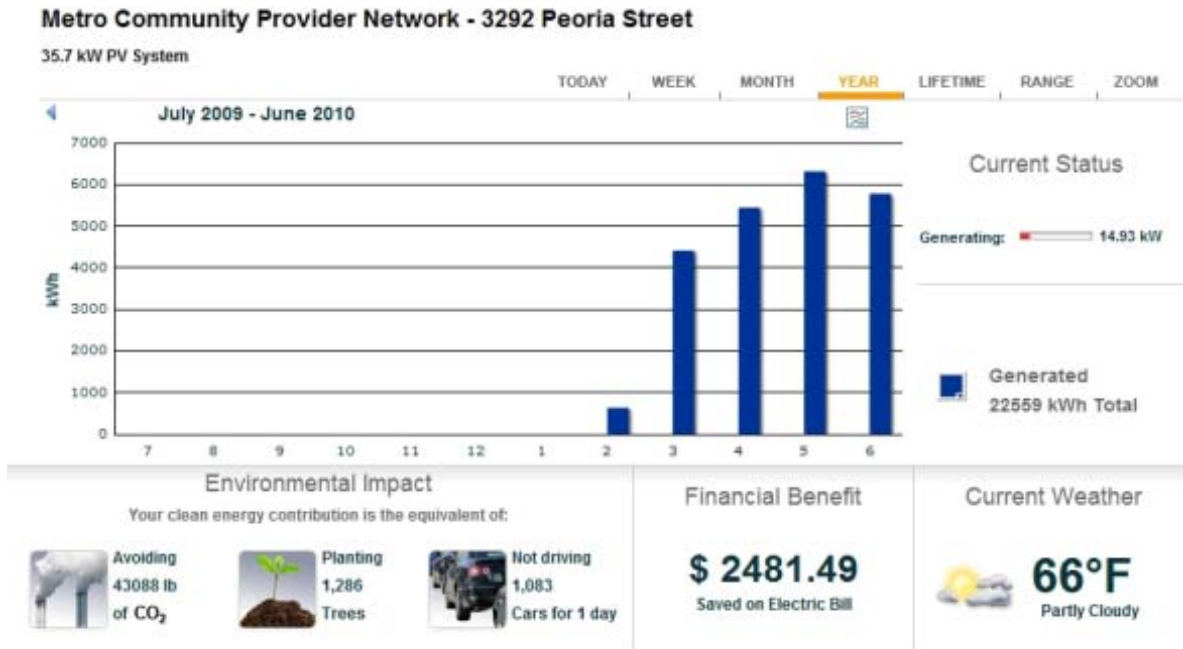
MCPN Solar Panel Savings Year-to-Date June 30, 2010.