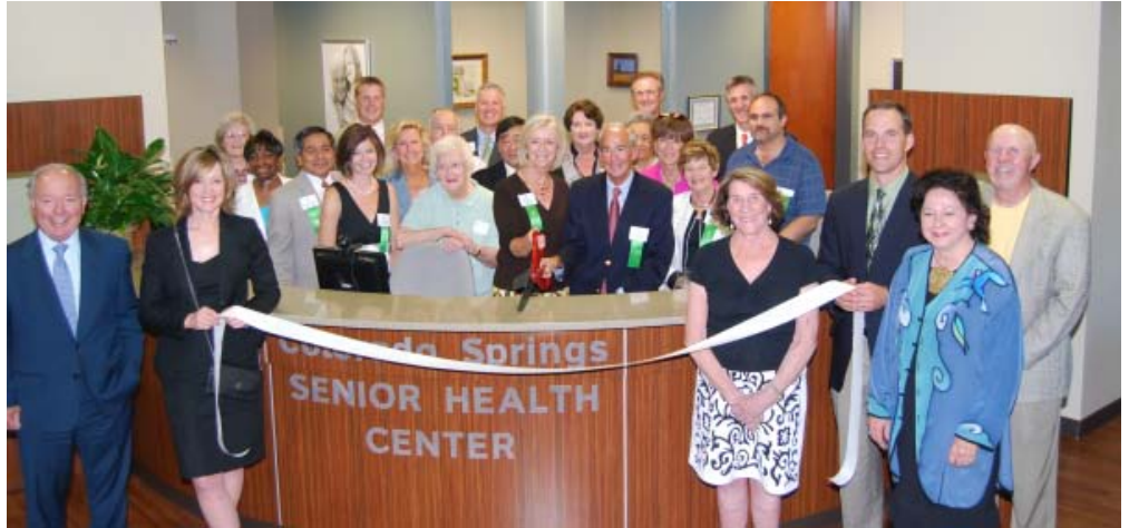
Community leaders await the ribbon cutting of Peak Vista's new Colorado Springs Senior Health Center, June 18, 2010.

The Colorado Springs Senior Health Center will serve new Medicare patients as well as those over sixty. The facility is 14,000 square feet with 12 exam rooms. A large group room dedicated to patients needing disease management for osteoporosis, diabetes, and hypertension is also on site. The new center focuses on medical care as well as behavioral health care, through a partnership with the University of Colorado at Colorado Springs (UCCS). Immunizations, physicals, outpatient medical procedures and specialty referrals are also available. A multitude of ancillary services, including dental care, are accessible to patients at the new site.