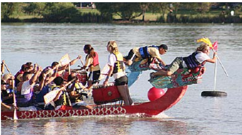
The Salud-Fort Lupton Dragon Boat team races for the finish line. July 25, 2010.