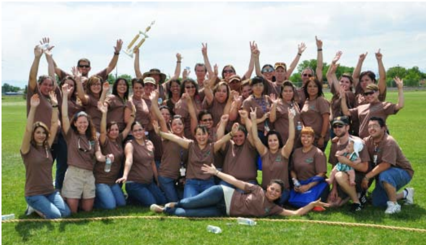
Salud held their annual clinic tug-of-war competition as part of the celebration on June 25, 2010. The Longmont clinic team, pictured above, brought home the trophy this year.