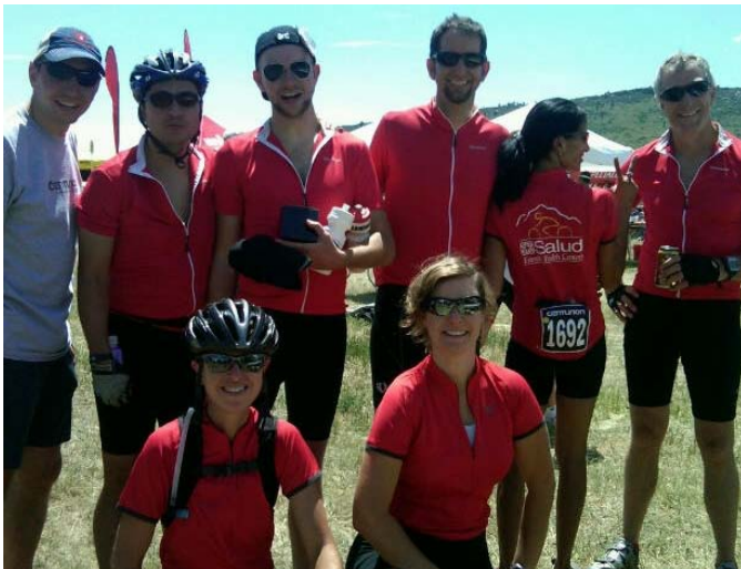
Salud's bike team shows off their winners' smiles, June 18, 2010.

The Colorado Springs Senior Health Center is one component of a major Community Benefit Initiative (CBI) launched by Peak Vista and its Foundation in 2009. The Community Benefit Initiative, Opening Doors to Healthcare Access, will, when complete, expand Peak Vista services by more than 13,000 patients.