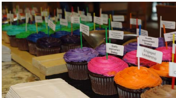
Learning Session participants shared cupcakes decorated especially for the initiative work.