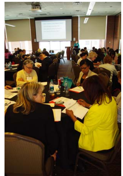
SNMHI Regional Learning Session participants gathered to work on PCMH transformation.

At the close of the all-day event, participants took the opportunity to gather as a group and discuss lessons learned, best practices, and innovative ways to move forward and continue work on PCMH transformation. These Learning Sessions have uniquely positioned Health Center staff to forge strong relationships and connections with one another, evolving into an empowered and motivated network of health care professionals.