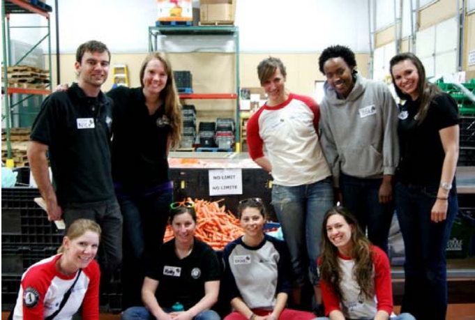
Salud's 2012-2013 HealthCorps Navigator team at Longmont's Community Food Share.