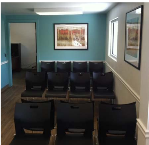
The waiting room at MCPN Helena Clinic is ready for patients.